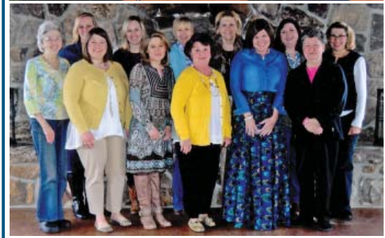
OUR LADIES ENJOYED TEACHING, WORSHIP, PRAYER AND FELLOWSHIP AT THE 2016 SPRING RETREAT!